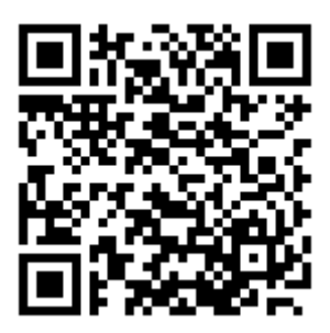
Technical Sheet > Contemporary villa in Apt > 742.000 euro https://www.proprietes-luberon.fr/contemporary-villa-in-apt-54

edith.ffimmobilier@gmail.com - 06 81 04 03 91